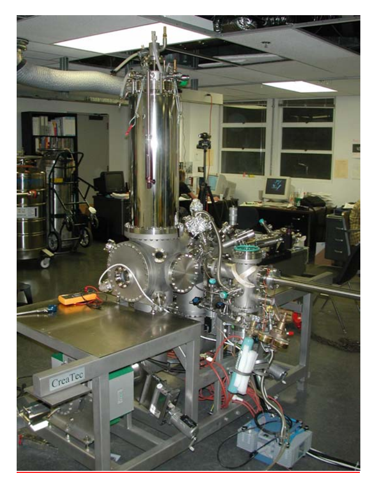
Figure 3. View of a Scanning Tunneling Microscope (STM) at the PICO lab of one of the authors (Gimzewski) at UCLA.

Scientists progressively turned up the magnification, but no matter how good the glass lenses were, how precise the brass tubes and screws were, at around x10, 000, the image goes fuzzier until, at x100, 000, the image is basically blank. This is called "the Raleigh limit", which says you cannot see anything with using a wave that is smaller than half the size of the wave. In other words, this light wave has a size just like an ocean wave has the distance between its crests. The length of the wave is the feature that limits what we "see" which has a limit when we use regular light of two hundred nanometers. It is already twice the size of a wire in a Pentium IV, or a few hundred times thinner than a hair -- it is back to the metric. To get higher magnification, scientists used shorter waves and even the wave properties of electrons. Nevertheless, despite the progress, the high energies and conditions required to make these higher resolution images started to destroy the very objects they wanted to "see". In effect, they ended up looking at matter using something like a focused blowtorch in a vacuum.