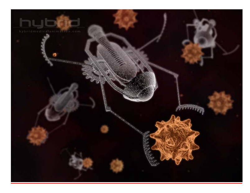
Figure 4. Floating in an aliquot of laboratory test fluid, these hypothetical early medical nanorobots are testing their ability to find and grasp passing virus particles.